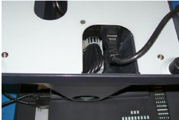
Figure 3, AC Power Cord Attachment

Plug the supplied AC cord into the power adapter mounted into the base. See photo below. Stand the system on its feet and snake the power cable through the cutout in the rear of the base.