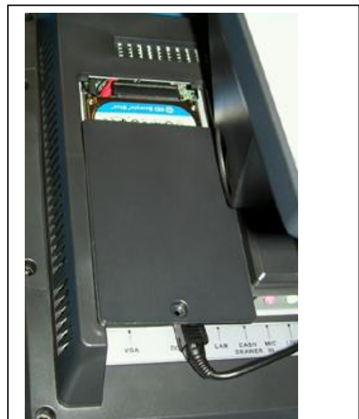
Figure 4, HDD seen under the opened door