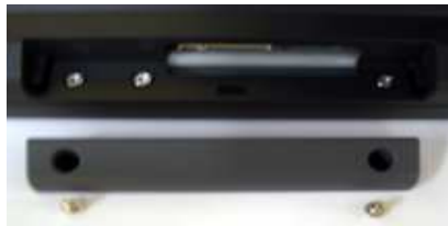
MSR cover plate removed

On the rear, left side of the LCD display, remove the screws (2) holding the plastic cover. See picture right. Remove the plastic cover. There are 3 screw holes; see picture below.