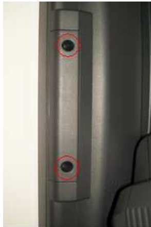
MSR jack cover plate